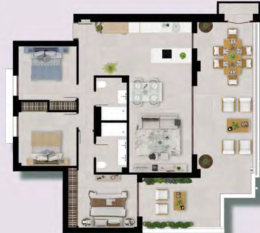
APARTMENT - 3 BED PROPERTIES